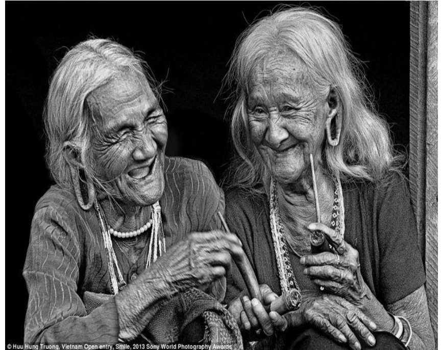
© Huu Hung Truong, Vietnam Open entry, Smile, 2013 Sony World Photography Awards